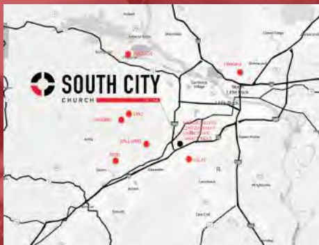
CITY GROUP LOCATIONS

SOUTH CITY GROUPS COMMUNITY / CARE / DISCIPLESHIP